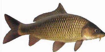
Made from whole European Carp